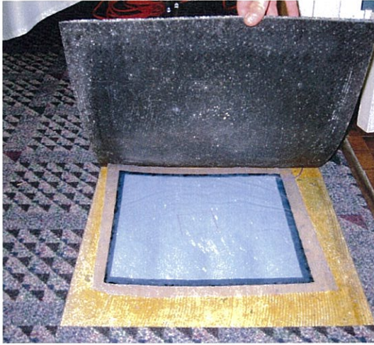
MODEL SEC-FS-E3-M1 or SEC-FS-M1 SECURITY - FORCE ACTIVATED SENSORS